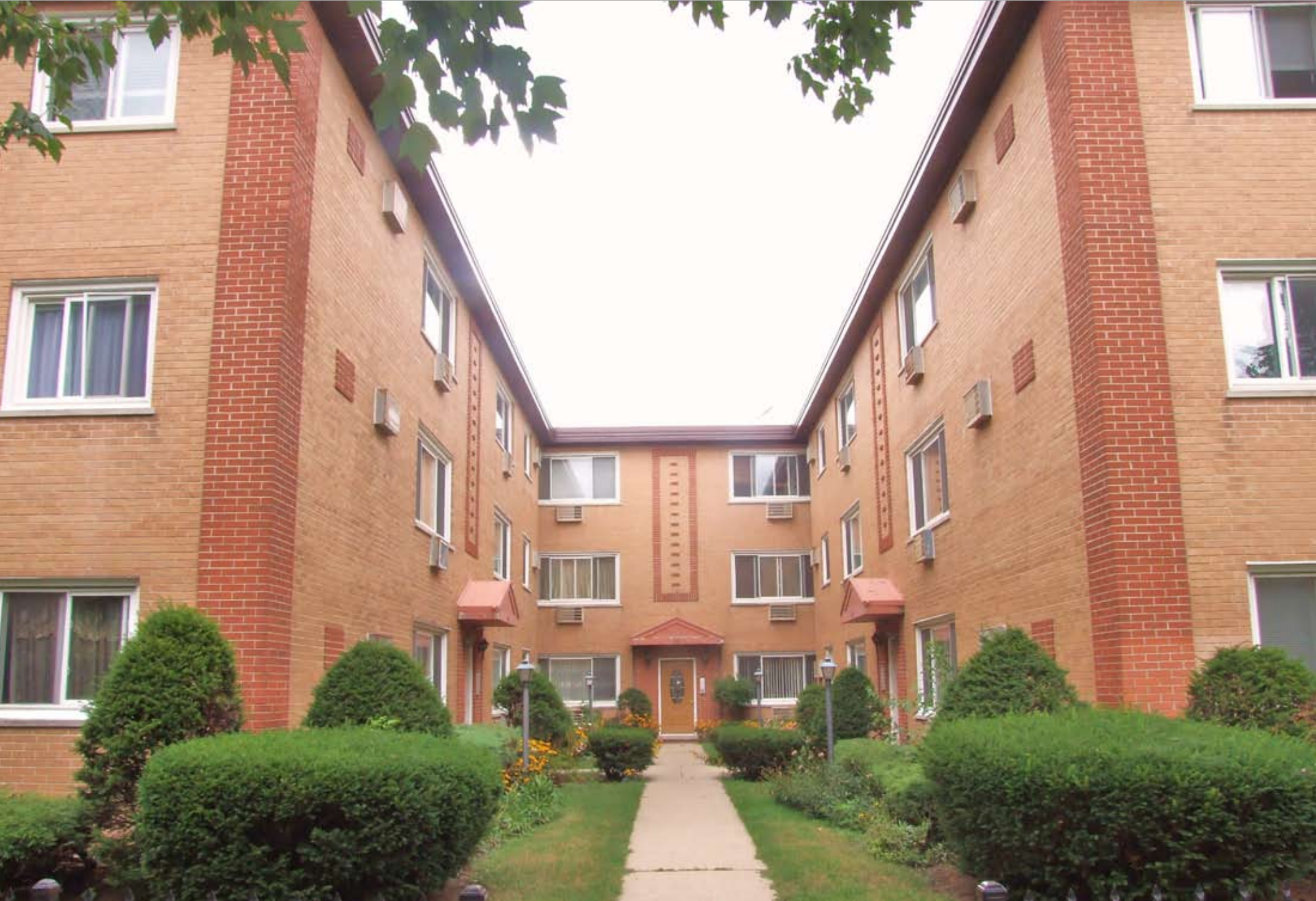
1628 WEST GREENLEAF, UNIT 2S