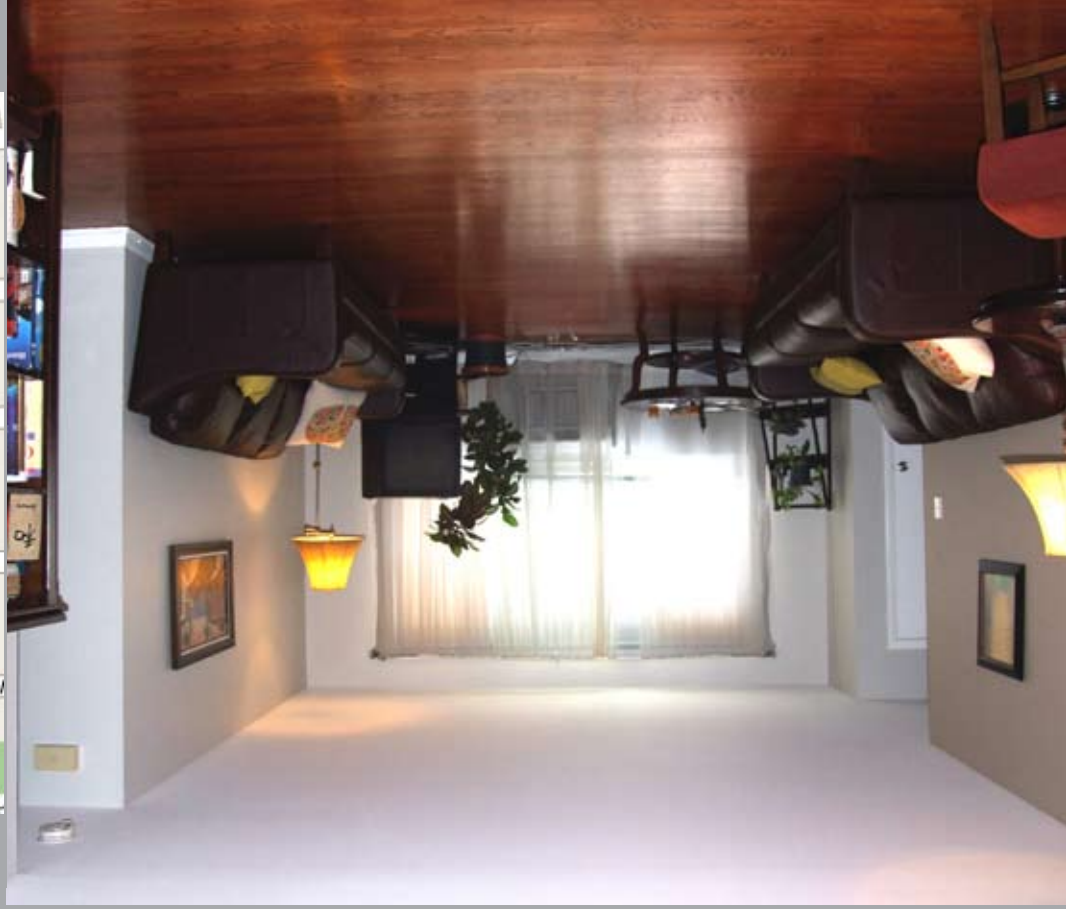
1628 WEST GREENLEAF, UNIT 2S